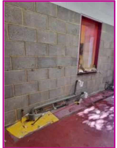
The before and after pictures of our renovation